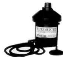
Water Recovery Systems

CALL NOW! Toll Free 877-448-7486 www.watermeisterusa.com